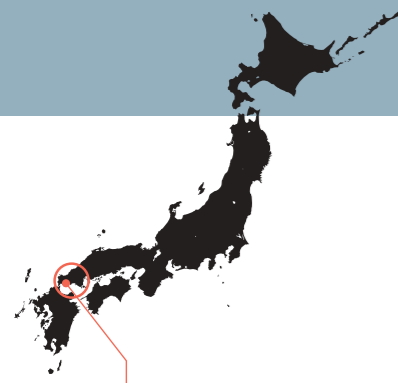
Ube City, Yamaguchi

The 27th UBE BIENNALE UBE International Sculpture Competition